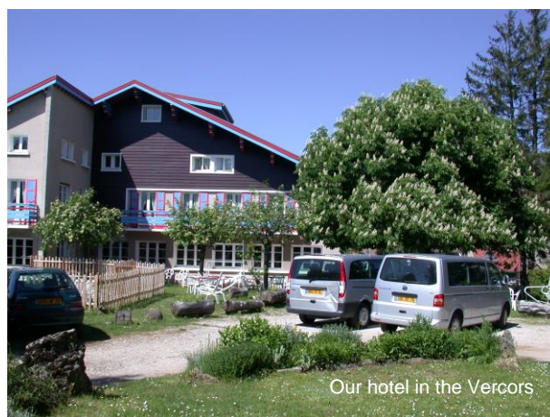
Our hotel in the Vercors