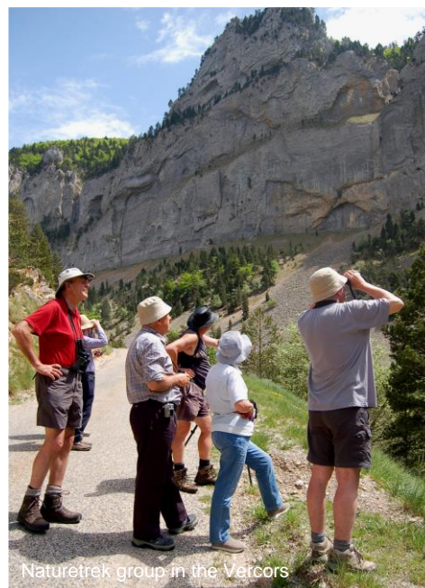
Naturetrek group in the Vercors

We will be based for the duration of our holiday in a small, charming, family-run hotel in La Chapelle-en-Vercors, on the doorstep of the dramatic Haut Plateaux.