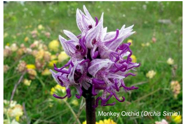
Monkey Orchid ( Orchis Simia )

In order to book your place on this holiday, please give us a call on 01962 733051 with a credit or debit card, book online at www.naturetrek.co.uk , or alternatively complete and post the booking form at the back of our main Naturetrek brochure, together with a deposit of 20% of the holiday cost plus any room supplements if required. If you do not have a copy of the brochure, please call us on 01962 733051 or request one via our website. Please stipulate any special requirements, for example extension requests or connecting/regional flights, at the time of booking..