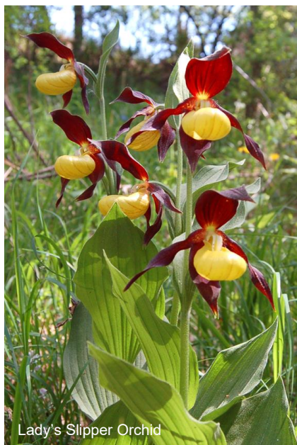
Lady's Slipper Orchid

We will make our way to a point north of the village of Les Nonnieres, passing clumps of Blue Aphallanthes ( Aphallanthes monspeliensis ), to explore some pine woods and meadows. These woods are particularly rich, containing a good number of Lady's Slipper Orchids ( Cypripedium calceolus ), Bird's-nest Orchid ( Neotia nidus-avis ), Fly Orchid ( Ophrys insectifera ), Phyteuma nigra (Black Rampion) and the Fly Honeysuckle ( Lonicera xylosteum ). From here we will return a little way south and enter the Vallee de Combau. Here we may see Chamoix as well as the local specialty Orchid ( Orchis spitzeli ) and Gentiana angustifolia (Trumpet Gentian). Lunch will be taken at the top of the valley, next to a stream and a ford. After lunch we will visit the delightful village of Archiane and its towering limestone cliffs.